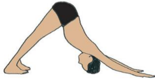
Adho Mukha Svanasana